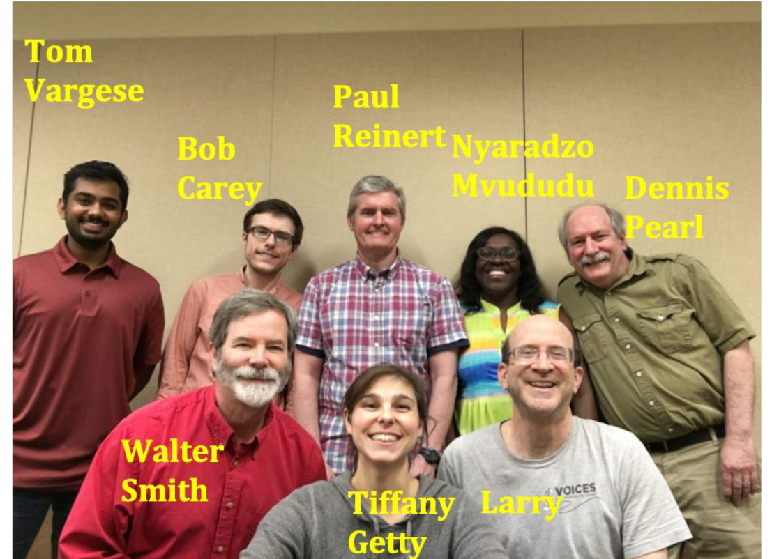
2019 Meeting in Penn State