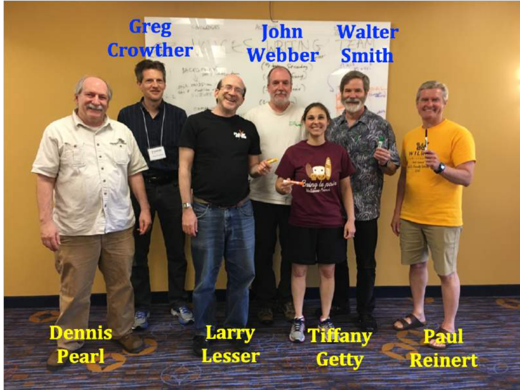
2018 Denver Writing Committee